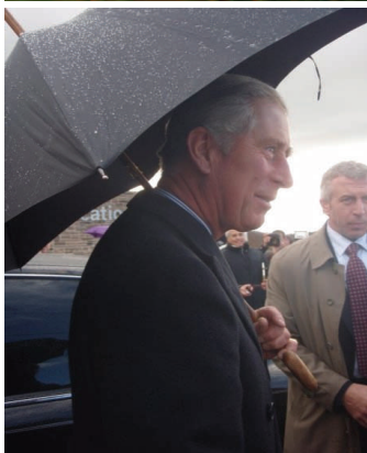
Prince Charles shakes hands with the public at Niagara College.

His Royal Highness The Prince of Wales visited Niagara College November 5 as honoured guest at the opening of Niagara College's new Wine Visitor + Education Centre at the Niagara-on-the-Lake Campus.