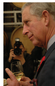
"Remarkable" was the word describing wines tasted by His Royal Highness.